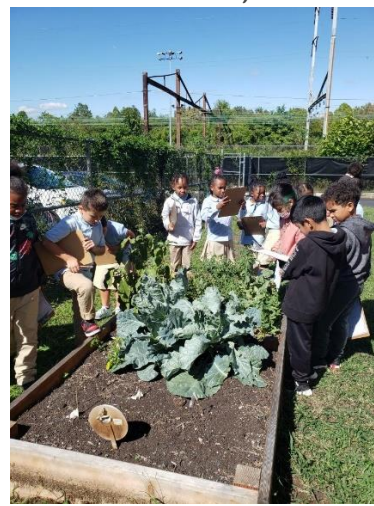
Students at PJ Hill in the garden!