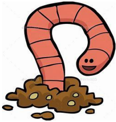
Leon, the Ground-dweller