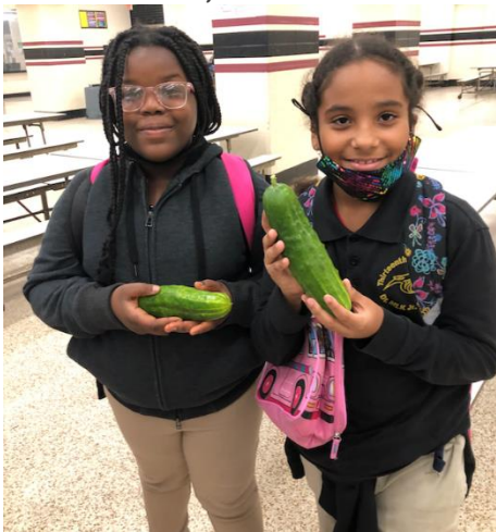
Cucumber harvest at 13 th Ave. School