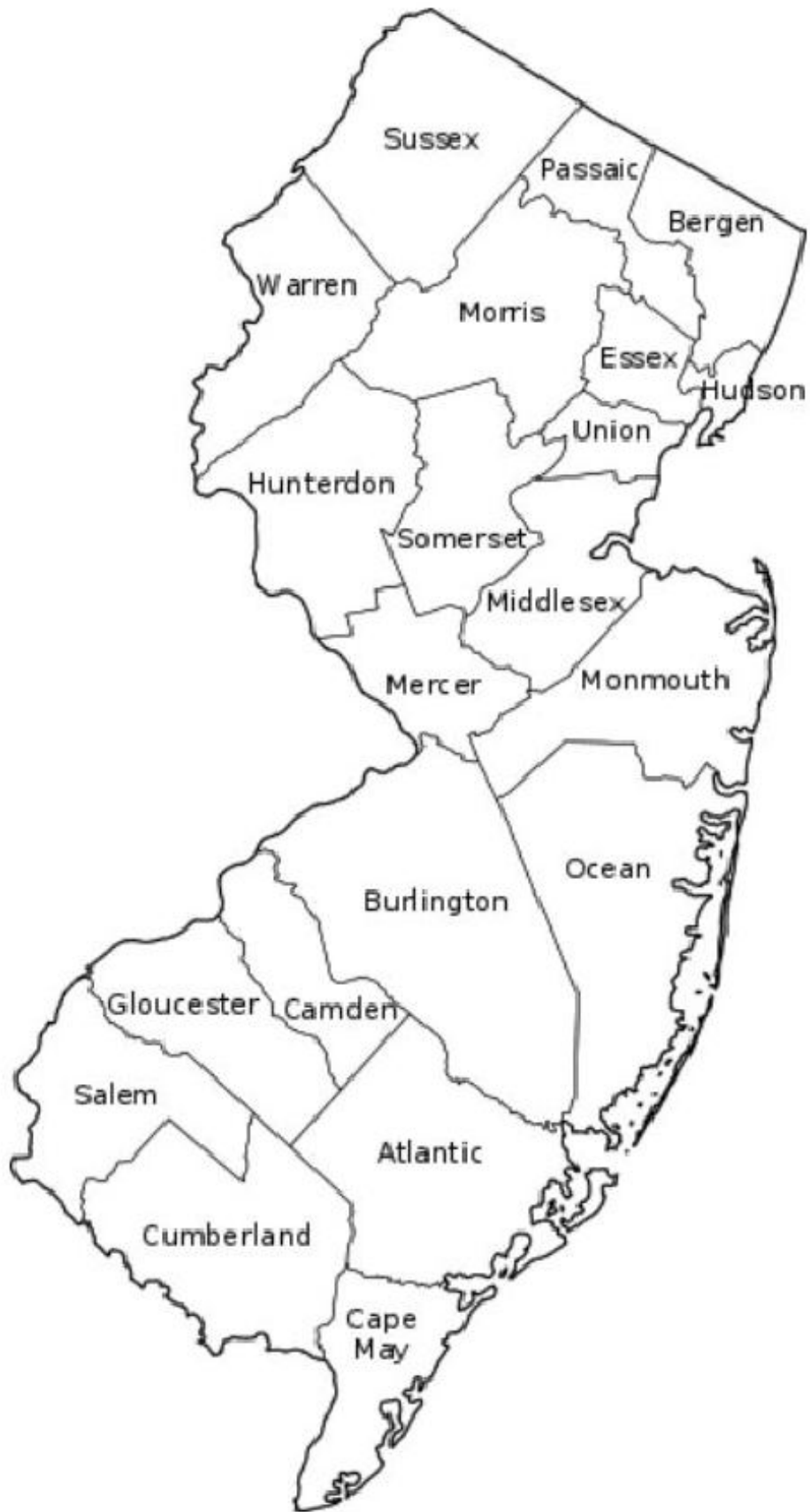
County Map of New Jersey